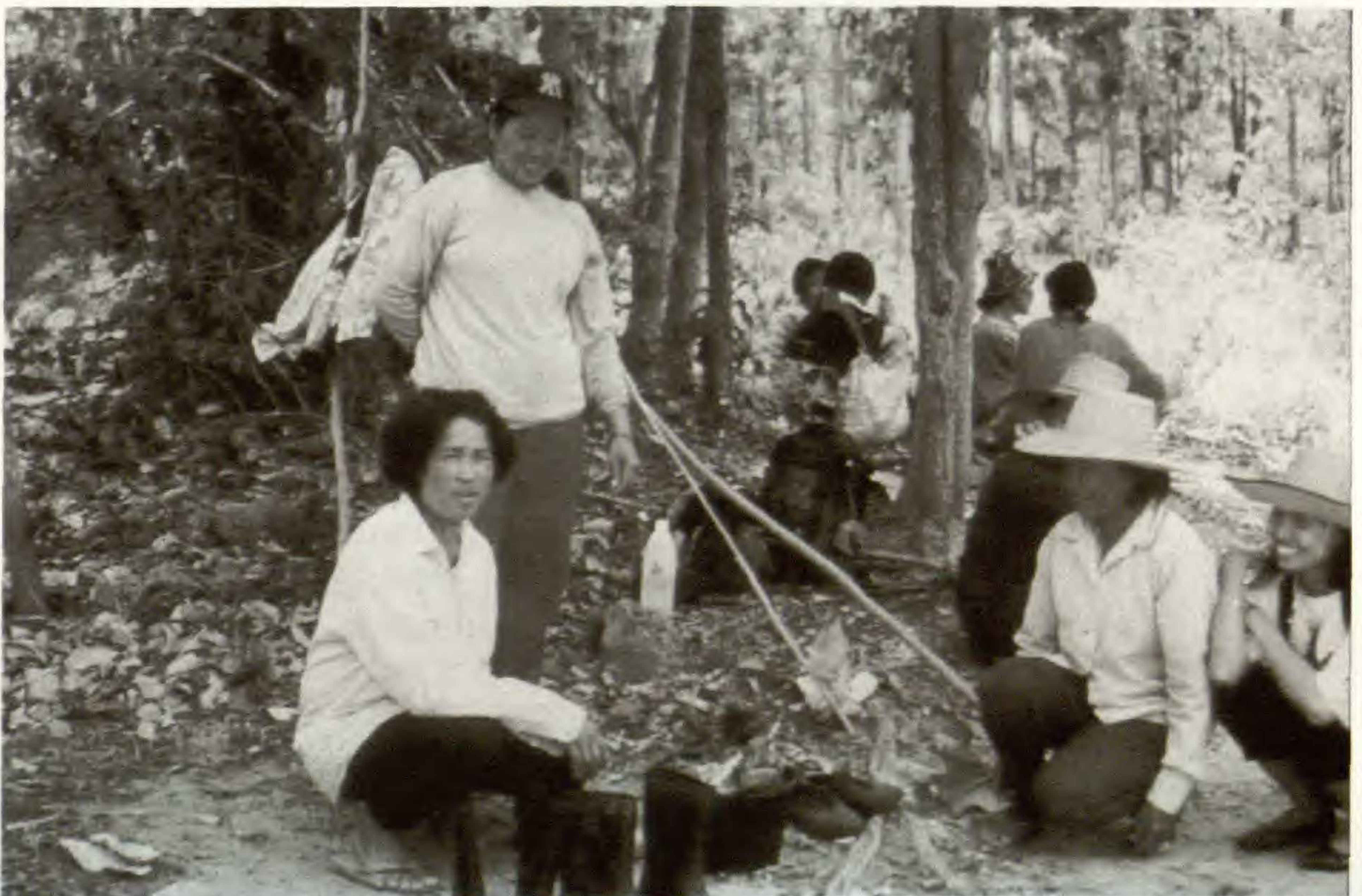
FIGURE 3.—A gathering party.

Life-ways are changing rapidly in Isan and villagers are being affected in terms of economics, social relationships and culture. At the local level, a growing influence of the nationalized central Thai image, an increase in development projects, and a rising monetization of the economy are beginning to influence the regional lifestyle in a variety of ways. Local resources, which used to dominate home use,